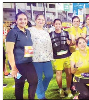
Excited participants posing for photograph during midnight marathon at Jammu.

of run- 42KM, 21KM, 10KM and 5KM through a very grueling challenge of route within the city covering Tawi Bridge and one over bridge. There were 298 people from various parts of Jammu and Kashmir, Punjab, Haryana, Delhi, Uttar Pradesh, Himachal Pradesh and West Bengal who participated in cutting across the society and