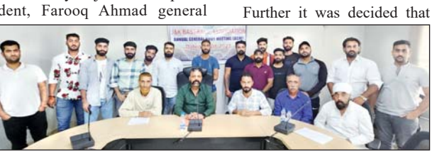
Jammu and Kashmir Baseball Association members posing for photograph during annual meeting.

and initiatives to promote and strengthen the Baseball in both the regions of J&K Union Territory. During the meeting the achievements and hurdles faced by the J&K Baseball Association were also given thorough discussion. Further it was decided that