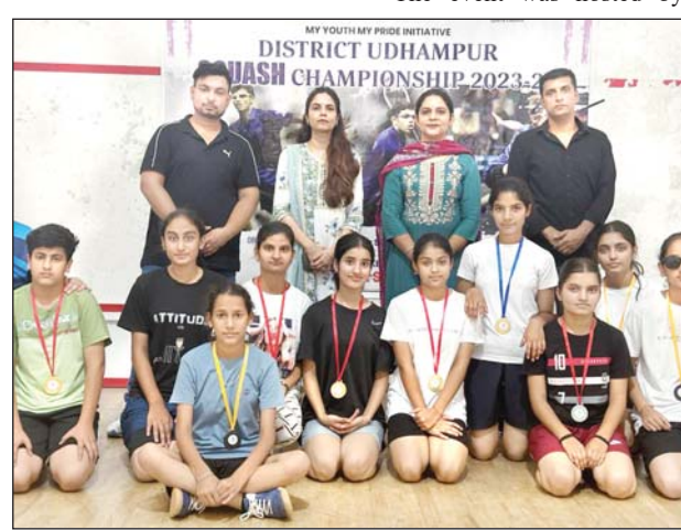
Squash players posing with dignitaries at Jammu.

Paul was in a vehicle with her baby on Tuesday when police say a transport truck entered a construction zone on Country Road 124 in Melancthon Township and crashed into the lineup of stopped cars. (PTI)