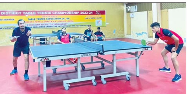
Table Tennis players in action during a match at Jammu on Sunday.