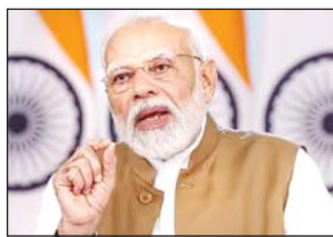
Prime Minister Narendra Modi on Sunday hailed Indian athletes' performance at the World University Games in Chengdu, saying they had done the nation proud by returning home with a record haul of 26 medals.

Speaking on Mann Ki Baat, the PM said, "India displayed its best performance in the Games (WUG) this time. Our players won 26 medals in all, out of which 11 were gold medals. You will be pleased to know that even if we add all the medals won in all the World University Games that