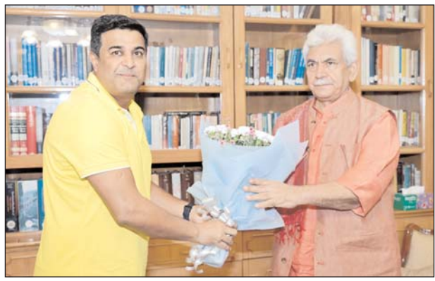
National Business Head Retail & Business Banking, ICICI Bank during meeting with LG