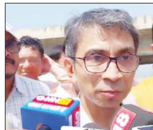
A senior NHA officer speaks to media persons at Tarnah bridge in Kathua on Tuesday.

respond on whether the responsibility for washing away of a part of Tarnah bridge in Kathua dis-