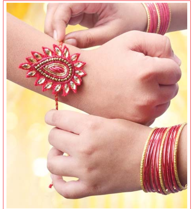
Happy Raksha Bandhan To All Our Readers