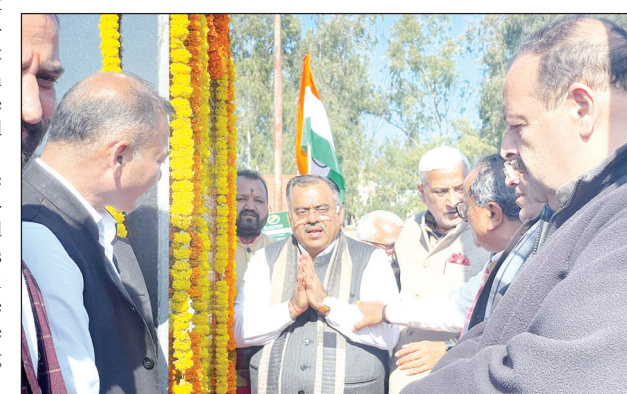
BJP leaders paying tribute to Praja Parishad martyrs at Jourian on Tuesday.

gave PoJK on platter to Pakistan despite the fact that the Pak raiders were on run. He said that Indian forces will retrieve every inch of Indian territory under forcible occupation of Pakistan.