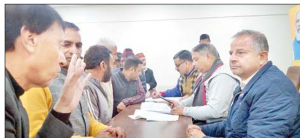
BJP leaders listening public grievances at Jammu on Wednesday