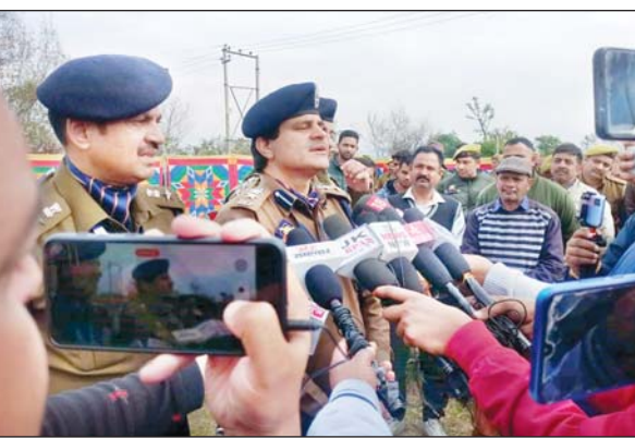
People staging protest in Sunjwan area of Jammu on Wednesday.

The protesting people said that on one side they are being assured that no residential or commercial establishment raised on small portion of land will be touched in the anti-encroachment drive and on the other