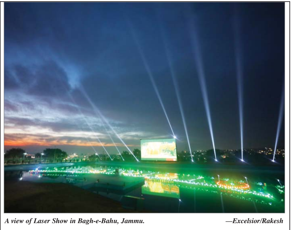
A view of Laser Show in Bagh-e-Bahu, Jammu.