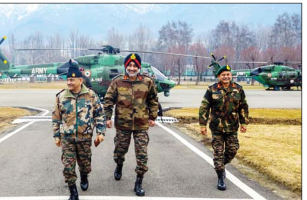
CDS Gen Anil Chauhan during his visit to Kashmir on Thursday.