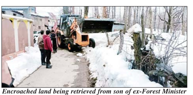
Encroached land being retrieved from son of ex-Forest Minister and NC leader Peerzada Ghulam Ahmad Shah at Qazigund on Thursday.

Fayaz Bukhari SRINAGAR, Feb 2: The Administration in Anantnag today razed the shopping complex of Hurriyat Conference leader, retrieved the State land from the widow of former Union Minister of State for Home Affairs and kin of former Forest Minister.