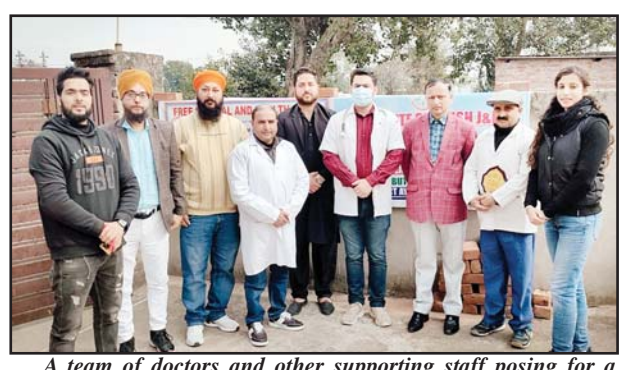
A team of doctors and other supporting staff posing for a group photograph at a medical camp in Jammu on Friday.