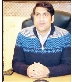
Former Minister Manjit Singh addressing meeting at Ramgarh on Friday.

feedback about the range of products that are produced in the District having demand in national and international markets and can prove key to make Srinagar an Export Hub under One District One Product (ODOP).