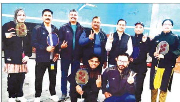
Selected players for Badminton championship posing for a group photograph at Jammu on Saturday.

The people of the area appreciated the support provided by the Indian Army to encourage sports activities among youth in Doda district.