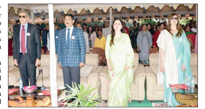
Dignitaries and Students during 'National Anthem' at BSF School Jammu on Saturday.

At culmination of the trek, the participants were given certificates by the chief guest.