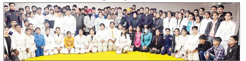
Winners of Judo Championship posing for a group photograph at MA Stadium Jammu on Saturday.