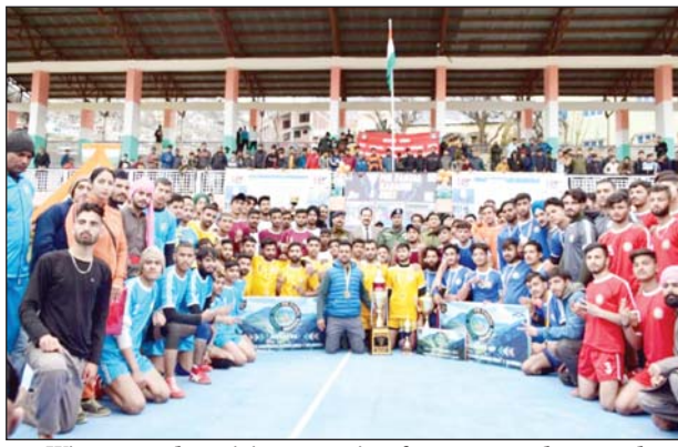
Winners and participants posing for a group photograph at Doda on Saturday.