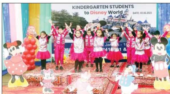
Students performing during an event at Jammu Sanskriti School Jammu on Saturday.