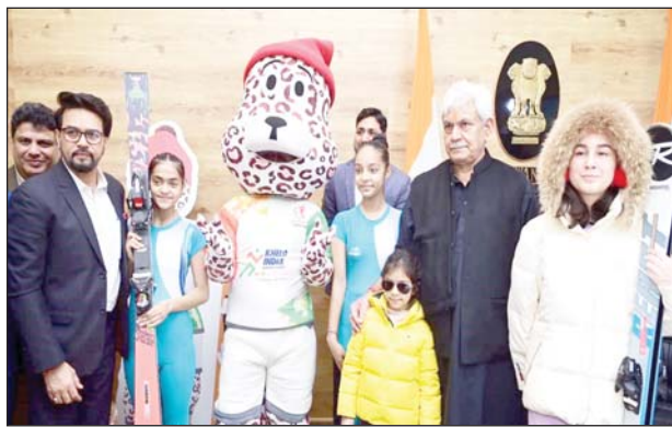
LG Manoj Sinha and Union Sports Minister Anurag Thakur launching 3rd Khelo India National Winter Games Anthem, Mascot and Jersey at Raj Bhavan on Saturday.

the players, sports lovers and officials participating in the National Winter Games. Gulmarg, the world-renowned winter tourism destination has been developed as a sports city to host the largest ever contingent of 1500 players from across the country, said the Lt Governor.