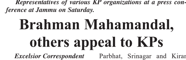
Representatives of various KP organizations at a press conference at Jammu on Saturday.

During the meeting, the functioning of the district offices, the status of ongoing public outreach programs, and progress made under recovery and repayment of the districts were reviewed. The Director exhorted upon the District Nodal Officers to double their efforts in