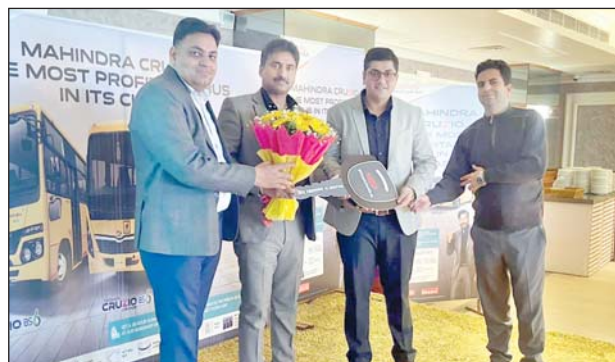
Executives from Mahindra Truck and Bus Division handing over keys to representatives of different schools in Jammu on the launch of Mahindra CRUZIO BS6 School Bus.