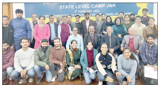
Vigyan Parishad J&K team with the students selected for National Level Talent Search Camp.