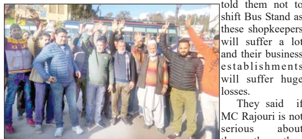
Beopar Mandal members protesting on Sunday.

Excelsior Correspondent RAJOURI, Feb 5: Beopar Mandal members Rajouri today regarding making old Bus Stand as parking place. They told that they have already bring it into the notice of MC Rajouri and told them not to shift Bus Stand as these shopkeepers will suffer a lot and their business establishments will suffer huge losses.