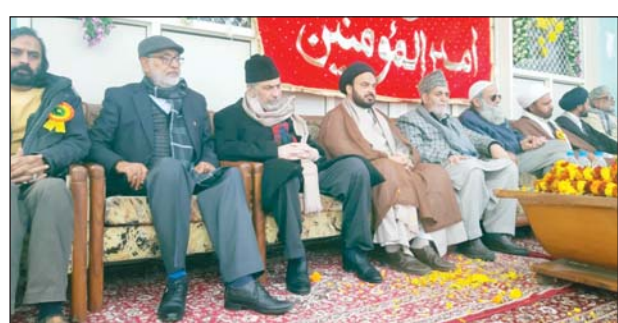
Religious leaders, poets and intellectuals during a national conference on Sunday.