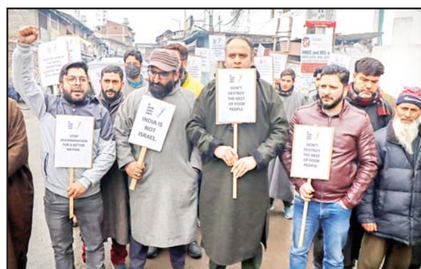
JKAAP during a protest against anti-encroachment drives in Srinagar on Monday.

Officials present in the workshop provided related informa-