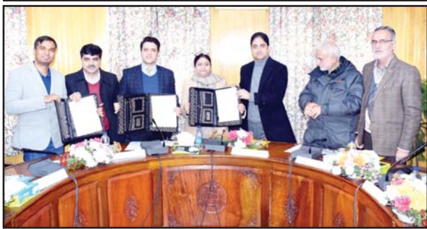
Dignitaries displaying copies of MoU signed by KU, Azim Premji University, SMC to improve quality of education in Srinagar schools.