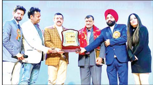
Office bearers of Performing Arts Association presenting memento to a dignitary at Reasi on Monday.

Chairman Jagdeep Dhankhar, however, did not allow their request, asking them to let the listed business conclude. With the Opposition parties unrelenting, he adjourned the House for the day.