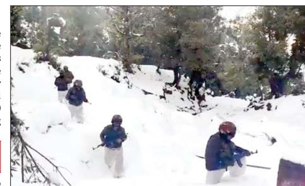
Army searching absconding militants in a snow-bound area of Rajouri

Seven people were killed and 14 injured as terrorists attacked Dhangri village in Rajouri on