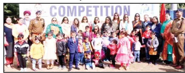
Children with their mothers and others posing for a group photograph during Healthy Baby Competition in Jammu on Saturday.