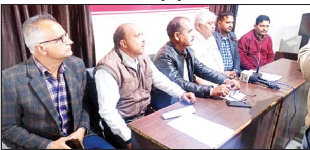
USTA leaders addressing a press conference at Jammu on Saturday.

About 60 doctors from Health Department (Periphery Hospitals) including from District Hospital Ramban, Udhampur; GMC Doda; ASCOMS Hospital Jammu and from AIIMS Jammu participated in the program. Besides, all the faculty members of Department of Paediatrics and Neonatology, GMC Jammu; Medical Superintendent and Deputy Medical Superintendent, SMGS Hospital, Jammu attended the program.