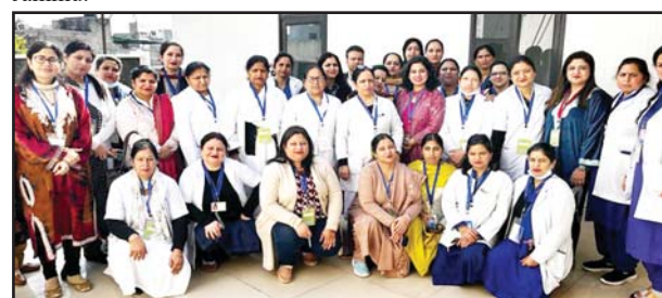
Nursing staff of GMC Jammu posing for a photograph during a course.