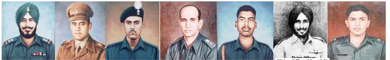
Subedar Joginder Singh Major Shaitan Singh CQM. Abdul Hamid Lt. Col. Ardeshir Tarapore Lance Naik Albert Ekka Flying Officer Nirmal Jit Singh 2nd Lt. Arun Khetrapal