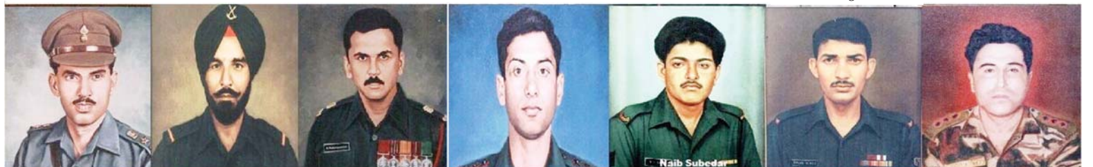
Major Hoshiar Singh Naib Subedar Bana Singh Major Ramaswamy Parameswaran Captain Manok Kumar Pandey Naib Subedar Yogendra Singh Yadav Riflemen Sanjay Kumar Captain Vikram Batra

As the first PM of the undivided but free India (a small part though-- Andaman & Nicobar had been liberated by then) Netaji had gone to these islands and hoisted the tricolor on 30th December 1943.