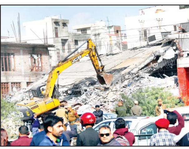
A JCB bulldozing an illegal structure in Jammu on Saturday. (Contd on page 2 Col 5)