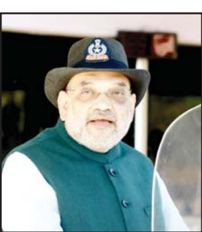
Northeast and increasing violence in the Left wing extremism areas, were three major challenges to a large extent," Shah said addressing the Passing Out Parade of 74th batch of the Indian Police Service (IPS) probationers at the Sardar Vallabhbhai Patel National Police Academy in Hyderabad. He said a new era of development has begun today in Jammu and Kashmir and terror incidents have come down significantly after abrogation of Article 370. He said under the leadership of Prime Minister Narendra Modi, the main reasons for reduction in terror incidents across the country, are the policy

Excelsior Correspondent JAMMU, Feb 11: Union Home Minister Amit Shah said today that a new era of development has begun in Jammu and Kashmir as there has been huge reduction in terror incidents in the Union Territory following abrogation of Article 370 of the Constitution of India which granted special status to erstwhile State. "When we assess internal security scenario of the country eight years ago, the terrorist incidents in Jammu and Kashmir, insurgency inside the