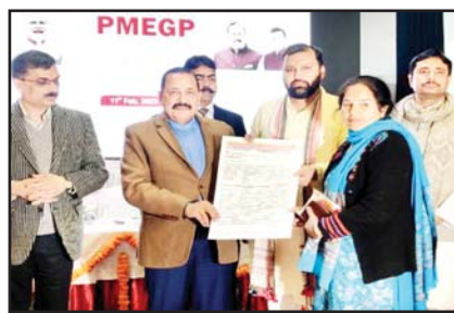
Union Minister Dr Jitendra Singh distributing subsidy amount to a beneficiary at Udhampur on Saturday. Government under PM Modi has strictly worked on the mantra of justice to all and appeasement to none by (Contd on page 2 Col 3)

Excelsior Correspondent UDHAMPUR, Feb 11: Calling upon party activists to reach out to the beneficiaries of PM Narendra Modi's developmental and welfare schemes in the UT of J&K, Union Minister of State in PMO with independent Charge of Science and Technology, Dr Jitendra Singh today asserted that these schemes have strengthened the party's base all over the country. Addressing a party's district Working Committee meeting here today, Dr Jitendra Singh said party activists should redouble their efforts to make