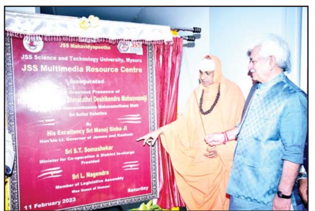
LG Manoj Sinha at a function in SJCE Mysuru on Saturday. Mahavidyapeetha has contributed to India's spiritual and knowledge heritage while guiding several generations to cherish its roots, our heritage with pride," he said. Sinha said in the last 8 years, the world has witnessed emergence of a new India which has resolved to regain its past glory, be the economic powerhouse and become the driving force for all-round development of humanity. He also highlighted the key role of educational institutions to realize the undiscovered potential of the students. "Education is the journey of the inner-self. This whole world is a university and every experience of life is education," observed the Lt Governor. Sharing the message of Mahatma Gandhi with the students, the Lt Governor said, the real meaning of education is to find the inner voice of oneself. "The inner voice is the only guide in your journey and through this inner voice one can achieve excellence in life. When (Contd on page 2 Col 1)