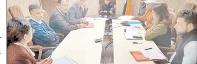
DC Avny Lavasa chairing a meeting in Jammu on Saturday.

Pandita said the Sharda Yatra temple at Teetwal was destroyed/burnt down in the aftermath of the partition and the subsequent Tribal invasions which also resulted in the holy pilgrimage being abandoned. A