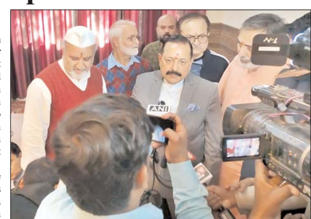
Union Minister, Dr Jitendra Singh talking to reporters after paying obeisance to Sharda Murti at Noida.

JAMMU, Feb 11: Union Minister of State in PMO, Dr Jitendra Singh with independent charge of Science and Technology, Dr. Jitendra Singh visited Kashmiri Sharda Bhawan in Noida to pay obeisance to Sharda Mata Murti that is on way to Teetwal in North Kashmir from Sringeri Mutth Kamataka.