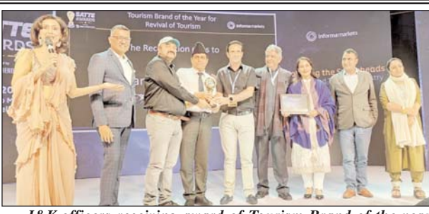
J&K officers receiving award of Tourism Brand of the year for revival of Tourism at SATTE.

The 30th edition of SATTE-2023 which was inaugurated by