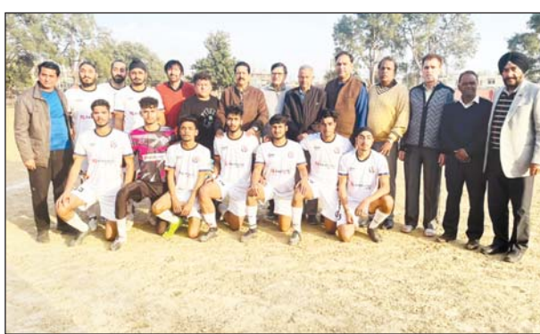
Winning team posing for a group photograph along with dignitaries at GGM Science College Ground Jammu on Wednesday

The GGM Science College team defeated Govt. College of Education team. Govt. College of Education won the toss and elected to bat first and secured 50 runs on board in 11 overs by losing all wickets.