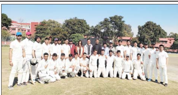
Players and CLUJ management posing for a group photograph at GGM Science College Ground Jammu on Wednesday

Renuka Singh (1/22) delivery tially deemed not out by the umpire but India successfully reviewed the decision and got it changed. Chinelle Henry (2) was the next to go as Mandhana and