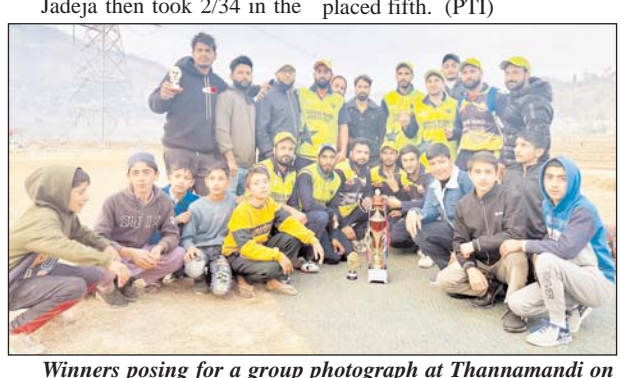
Winners posing for a group photograph at Thannamandi on Wednesday.

India's had dislodged the Pat Cummins-led Australia, according to an ICC update in the afternoon. Already the top T20 side, India had reached the number one spot in ODIs last month after beating New Zealand 3-0.