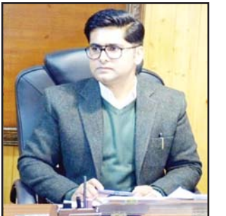
DC B'pora reviews revenue matters of Ring Road Phase-II

During the meeting various issues including execution of power purchase agreements with the farmers under component 'A' of the scheme and installation of bi-directional net meters for all rooftop solar consumers were discussed with the DISCOMs who assured their full cooperation for successful implementation of the scheme.