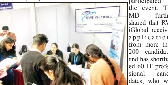
Officials of RVS iGlobal and job aspirants during mega job fair organized in Jammu.

This was stated by Managing Director (MD) RVS iGlobal