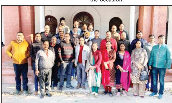
Plus 2 officers during a meeting in Jammu on Wednesday.