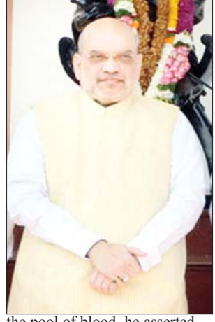
the pool of blood, he asserted. The Home Minister said the country has seen an 80 per cent reduction in violence from terrorism in Kashmir, insurgency (Contd on page 4 Col 1)

Excelsior Correspondent JAMMU, Feb 18: Union Home Minister Amit Shah said today that stone pelting has stopped in Kashmir and now there are theatres running and tourists visiting the Valley. "There used to be stone pelting and violence in Kashmir but now these things have stopped. There are theatres running and 1.8 crore tourists have visited the Valley in a year," he said while speaking at an event in Nagpur, Maharashtra. Shah said when Article 370 of the Constitution of India granting special status to Jammu and Kashmir was abrogated, speeches were made in Parliament that blood will flow in Kashmir. But no one even pelted a single stone, leave aside