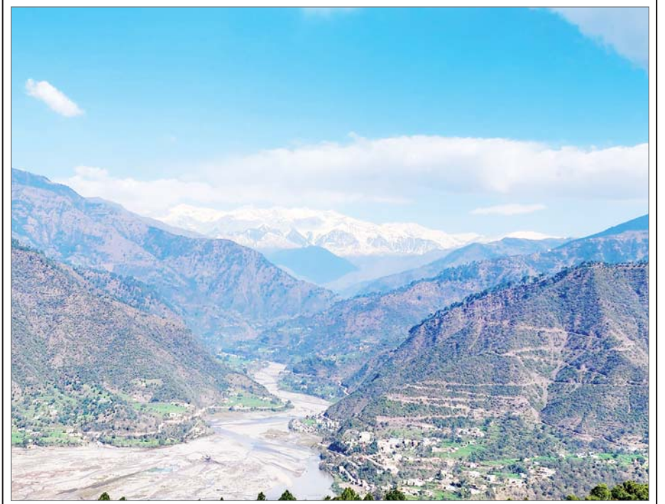
Panoramic view of village Arnas in Reasi district of Jammu region.

"This (project) is also very important as far as the security and safety of the country is concerned.... It will also help in the movement of our security forces in that region," sources said.