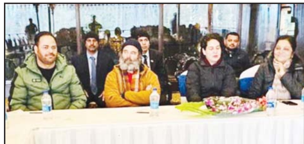
Congress leaders Rahul Gandhi and Priyanka during a meeting of senior party leaders at Gulmarg on Sunday.

was divided into two UTs against the wishes of the people. He added that people at both the places are being denied their democratic rights by the BJP aiming to hide its (BJPs) wrong policies and utter failure on all fronts.