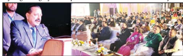
Union Minister Dr Jitendra Singh speaking after felicitating the awardees at "Big Impact Awards-2023" held at Jammu on Sunday.

The Union Minister said that India has come up to the global parameters as country's economy is growing by seven percent