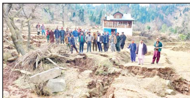
Broken land in Duksar hamlet of Ramban which was hit by landslide.

However, one residential structure in the hamlet was safe till last reports but the residents (Contd on page 4 Col 1)