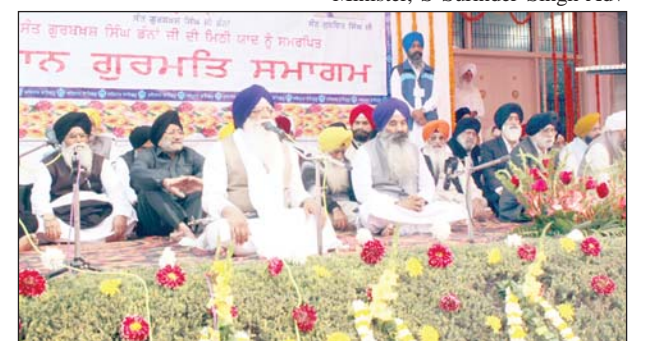
Head Granthi from Sri Darbar Sahib Amritsar speaking during religious function at Domana near Jammu on Sunday.