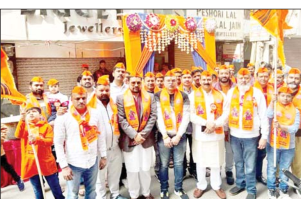
Representatives of various political and other organisations paying tribute to Chhatrapati Shivaji Maharaj at Jammu on Sunday

Congress general secretary communications Jairam Ramesh said the party recognises that opposition unity is important and added that this issue will be deliberated upon at the plenary session. "Nobody needs to give us a certificate that we have to lead because any opposition unity without the Congress will be unsuccessful. So we welcome the statement of Nitish Kumar, and as Venugopal ji has said this will be