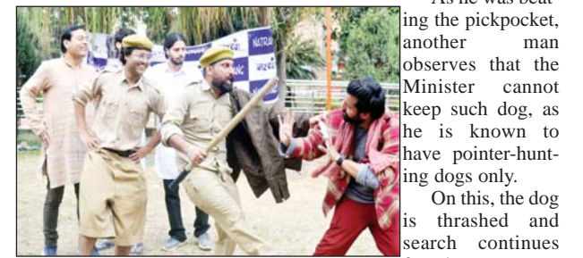
A still from play 'Girgit' staged in Jammu on Sunday.