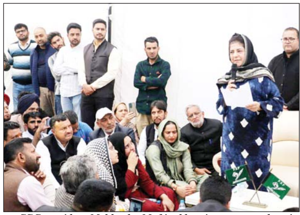
PDP president Mehbooba Mufti addressing party workers in Jammu office on Sunday.