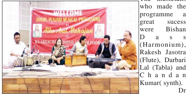
Artists during folk musical performance in Jammu on Sunday.

Excelsior Correspondent JAMMU, Feb 19: Alka Musical Group, Channi Himmat organised a Dogri-Punjabi Folk Musical programme on at KL Sehgal Hall.