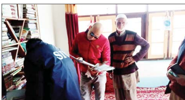
SIU team during searches at Tral on Monday.

conducted to collect more evidences of their involvement in other militancy related cases. The case (FIR No. 37/2022) has been registered in Police Station Tral