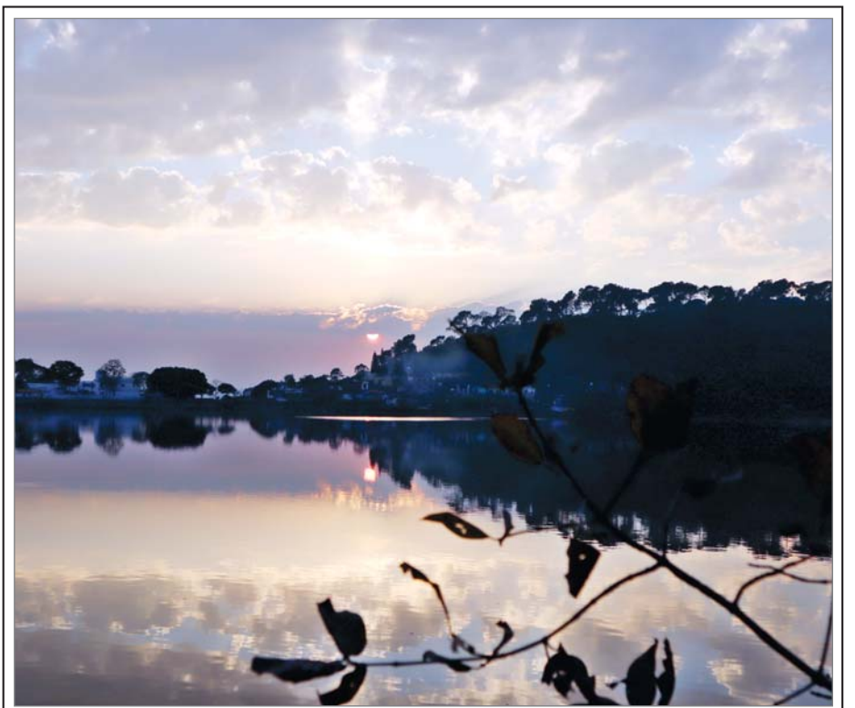
Panoramic view of Sunset over Surinsar lake in Jammu.

Official sources said that due to road widening activity recently, some boulders hit the hillock at Shelgarhi near (Contd on page 9 Col 3)