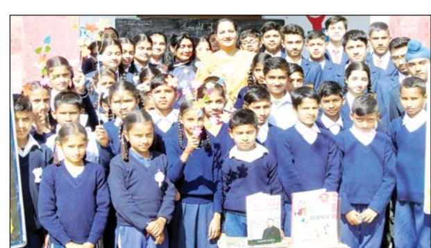
Students posing for a group photograph at GMS Parwah on Saturday.

The crowd will be fully behind South Africa and the home team will look to feed off them like they did on Friday.(PTI)