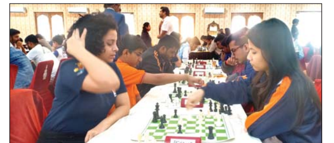
Players evincing keen interest during the Chess games at Jammu on Saturday.