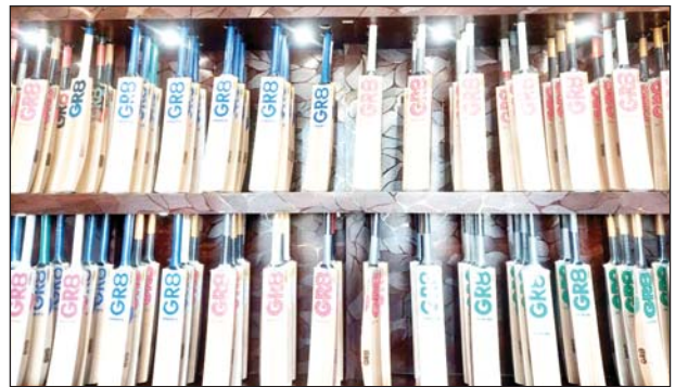
A view of Gr8 Sports, a bat making company at Sangam, Bijnbehara in Anantnag.

major stages. "We have taken the initiative to give them a platform, giving them the chance to compete internationally and demonstrate their talent," he said. He said that there is a need for