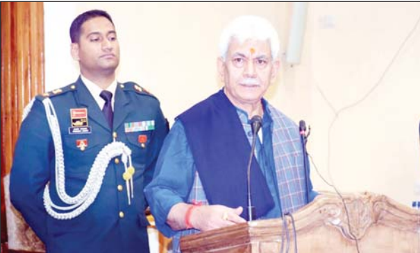
LG Manoj Sinha addressing a function in Srinagar on Monday.

Municipal Committees out of which 206000 fall below 1000 square feet which means 40 percent will not have to pay property tax. Further, we have 203600 houses that fall below 1500 square feet. Such houses have to pay maximum Rs 1000 annually as property tax," he added.