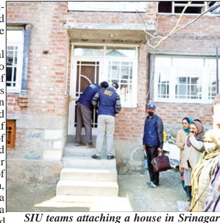
SIU teams attaching a house in Srinagar on Monday.

The power scenario in Jammu Kashmir, which was in shambles for decades, has witnessed a major turnaround with more electricity being supplied, especially in far-flung areas as compared to previous years, Sinha said.