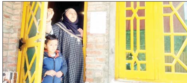
A house attached by the SIU in Srinagar on Monday.

ing and providing logistical support to active militants of TRF and LeT. The spokesman said that searches resulted in the arrest of the involved persons. "Also during the investigation it was found that the militants had been sheltered in the residential houses, 3 in Barthana Qamarwari and one at Sangam Eidgh Srinagar for providing shelter to militants."