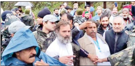
Cong leader Rahul Gandhi leading Bharat Jodo Yatra at Ramban on Wednesday.