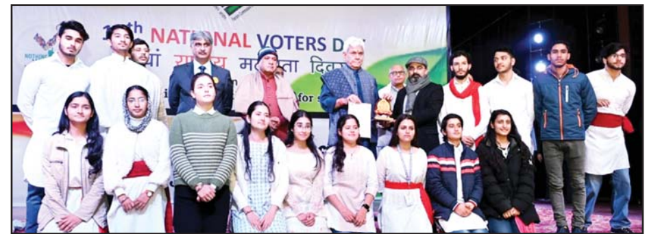
LG Manoj Sinha during National Voters Day celebration in Jammu.

The DC appreciated the gesture of the department of contributing towards the noble cause. He said that the funds generated from voluntary contributions to the Red Cross Fund are utilised for the social cause.