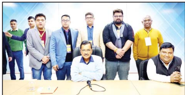
AAP J&K Youth wing leaders posing with the Party president Arvind Kejriwal in Delhi.