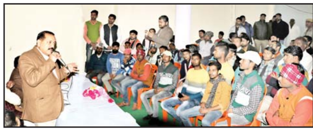
Union Minister Dr Jitendra Singh interacting with young first time voters, on the occasion of National Voters Day, at Mainpuri, UP on Wednesday.