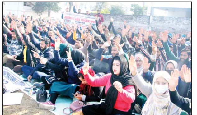
ReK teachers staging protest outside BJP headquarters, Trikuta Nagar Jammu.

witness various cultural programmes to impart festive look to the event. The meeting was also informed that the notable sports activities, which will be the hall-mark attractions of the '3rd Khelo India Winter Games', will include Snow Shoe Race, Ice Skiing, Ice Hockey, Skiing, Nordic Ski, Snowboarding, Ski Mountaineering and Ice Stock, besides other activities.