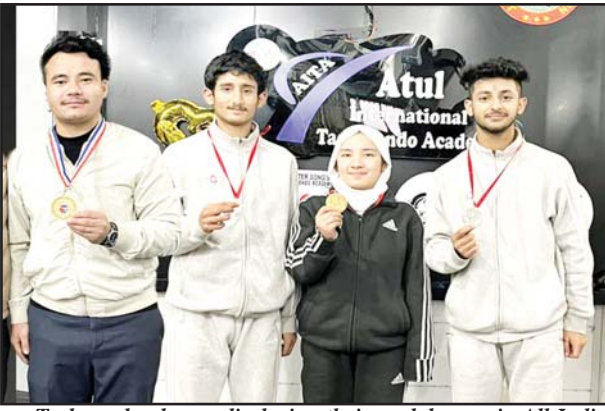
Taekwondo players displaying their medals won in All India University Games held at Amritsar (Punjab).