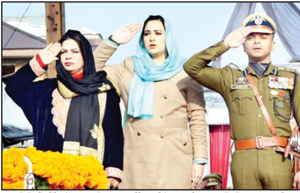
DDC Chairman Baramulla taking salute at R-Day parade.