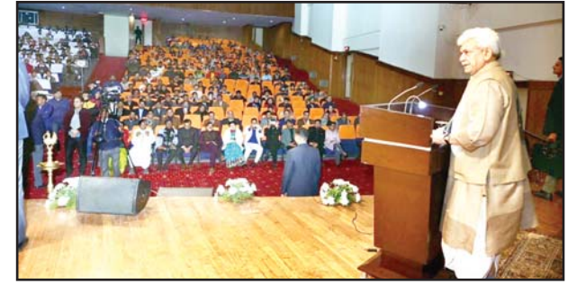
Lt Governor Manoj Sinha addressing Kavi Sammelan in Jammu.