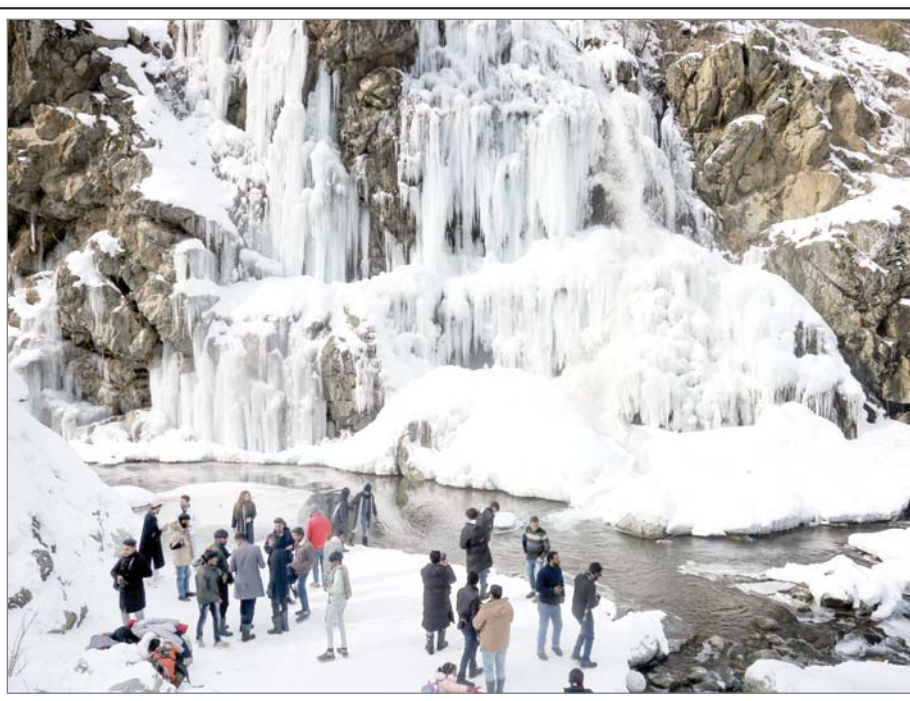
Visitors seen next to frozen waterfall during a cold winter day in Drung area of Tangmarg.

Regulations, the Government is empowered to review the performance of the employees on completion of 22 years of qualifying service or on attaining 48 years of age with respect to parameters like integrity, effectiveness, efficiency and utility.