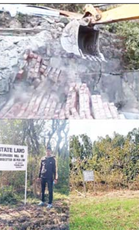
State land retrieved by Revenue officials in Basohli on Saturday.

He said of total 100 kanals of land, 15 kanals high-value (Contd on page 6 Col 3)