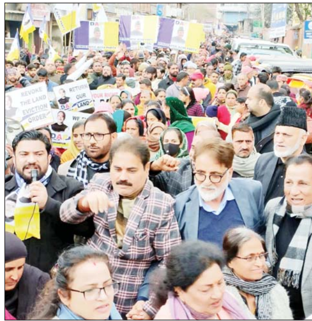
DAP leaders and workers protesting at Udhampur on Saturday.