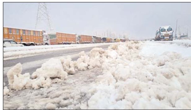
National Highway closed due to heavy snowfall at Qazigund.

and Samba -Mansar road. Batote-Kishtwar road was blocked due to landslides at Faggumarh near Thathri and Raggi Nalla between Batote and Doda today. The traffic remained suspended on the road for over 3-4 hours, however, the road was restored in the afternoon, a senior Traffic police officer said. Kishtwar-Paddar, Dachhan, Thathri- Gandoh, Ramban-Gool-Mahore-Reasi and Mahore-Budhal roads have been closed. Latti-Dudu-Basantgarh and Ramnagar roads have also been blocked due to heavy snowfall and landslides. A bus was trapped in mudslides on Thathri-Gandoh road today, however, the passengers were rescued. Hill resort of Patnitop experienced about 6-8 inch snowfall, Nathapat about 2ft, Bhaderwah about 5-6 inch, Dudu and Basantgarh about 6 inch snowfall by this evening. Trikuta hills of Mata Vaishnodevi also experienced fresh snowfall today. The chopper and battery car service at the holy shrine remained suspended today due to bad weather and snowfall while on-foot Yatra continued despite rain and snowfall. Three tourists trapped in heavy snow at Nathapat in Patnitop area were rescued by police today. They