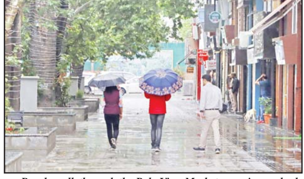
People walk through the Polo View Market, carrying umbrellas on a rainy day in Srinagar on Friday.

Excelsior Correspondent SRINAGAR, July 7: Weatherman today forecast widespread moderate to heavy rain in Kashmir till July 9 under the influence of monsoon winds and Western disturbance. Kashmir was lashed by rains today bringing down the temperatures across the region and giving respite to the people from hot weather. Director MeT office here Sonam Lotus said: "Under the influence of monsoon winds and western disturbance, widespread moderate to heavy rain with thundershower/lightning is expected in Jammu & Kashmir during 7- 9th July with main activity on July 8-9th." (Contd on page 4 Col 7)