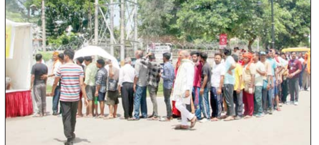
Amar Nath Ji bound pilgrims waiting in a long queue for on spot registration at a counter near Railway Station, Jammu on Monday. Another pic on page 4.

Excelsior Correspondent JAMMU, July 10: As yatra was also resumed from Baltal track after remaining suspended for three consecutive days today, over 24,000 pilgrims paid obeisance to naturally formed ice Shiv Lingam at holy cave by this evening. However, the yatra from Jammu to twin base camps of Nunwan -Pahalgam in South Kashmir's Anantnag district and Baltal in Central Kashmir's Ganderbal district remained suspended for the third consecutive