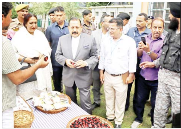
Union MoS, Dr Jitendra Singh inaugurating the Multimedia Exhibition at S.P. Secondary School in Srinagar on Monday.

The 5-days Integrated Communication and Outreach Program by CBC will serve as a platform to showcase the remarkable achievements of the past 9 years in the areas of public service, good governance, and welfare of the underprivileged.