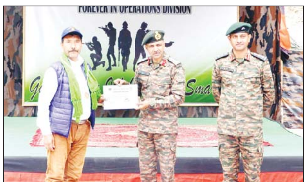
An Army officer felicitating a porter of Kargil War on Monday.

She expressed satisfaction with the increasing number of girls pursuing higher education and ensured that they receive the necessary facilities.