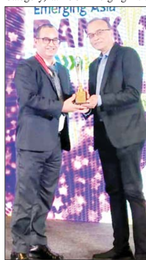
J&K Bank officer receiving award.

JAMMU, July 10: J&K Bank has been felicitated for the Best Performance in CASA-India (1st Runner up in Small Bank Category) at ICC Emerging Asia