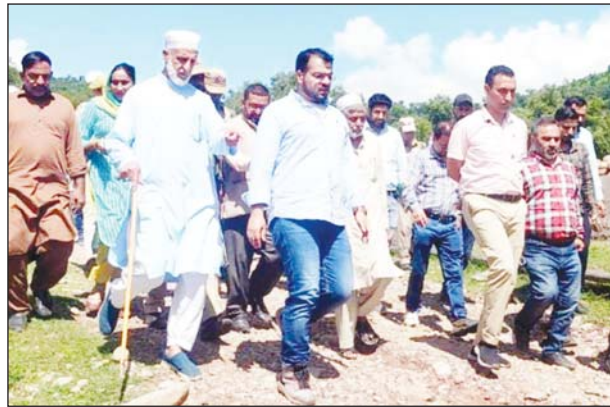
DC Poonch visiting landslide hit village Dhundak on Monday.

During the interactions, the Lt Governor assured the members of the delegations of appropriate action on the genuine issues and demands put forth by them.