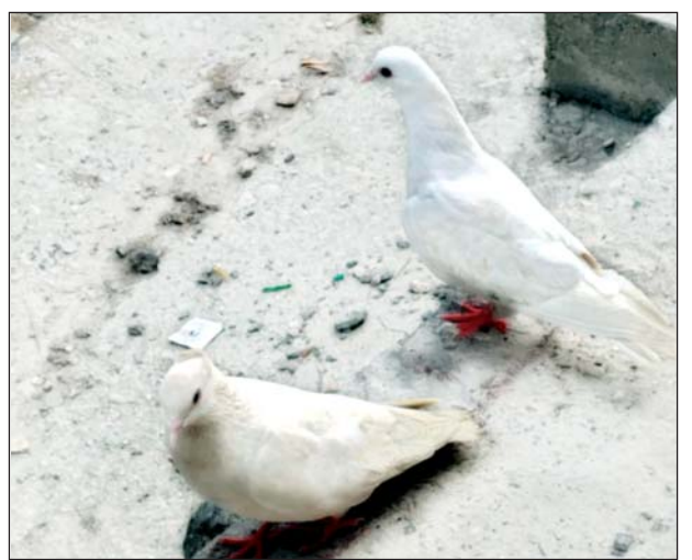
Two pigeons spotted near holy cave on Tuesday. Another pic on page 4.

Officials said 16,016 yatris performed darshan at cave shrine from twin tracks of Baltal and Nunwan-Pahalgam by this evening. With this, 2,67,499 pilgrims visited 3888 metre holy cave in deep Himalayas in last 18 days since the 62 day yatra started from twin tracks on July 1 this year. Officials said that the weather remained pleasant during the