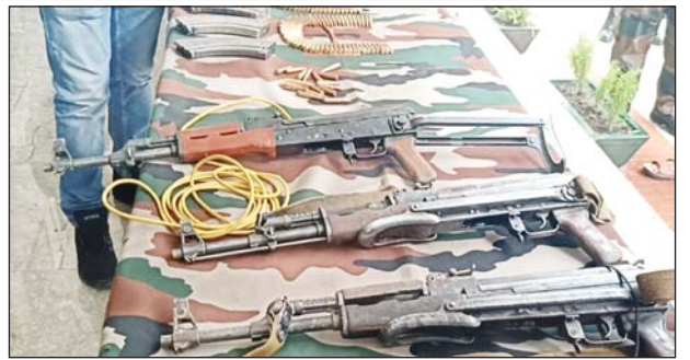
Arms and ammunition recovered from slain militants in Surankote on Tuesday. Another pic on page 4.

JAMMU, July 18: In a major success, security forces today eliminated four Pakistani militants at Sindhara Top in Surankote tehsil in Poonch district and thwarted their plot to carry out terror attacks on security personnel and civilians.