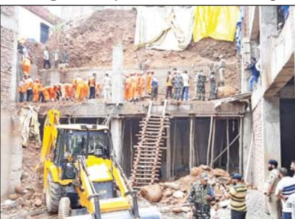
Rescue work in progress after the landslide hits under construction site in Udhampur.

*Watch video on www.excelsiornews.com 21, Kaller Himti, near Vegetable Mandi where a double storey building was being constructed by cutting a hillock.