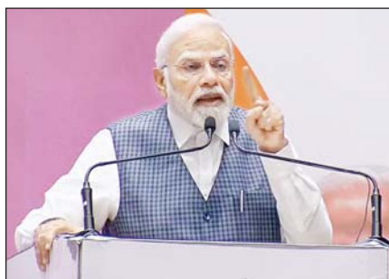
Prime Minister Narendra Modi during his address at the NDA leaders meet in New Delhi on Tuesday.

*True followers of Badal, Thackeray with us