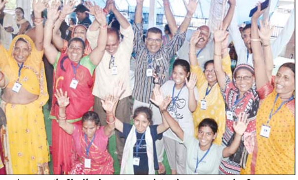
Amarnath Ji pilgrims at a registration counter in Jammu on Tuesday.

coiding with Raksha Bandhan festival falling on August 31.