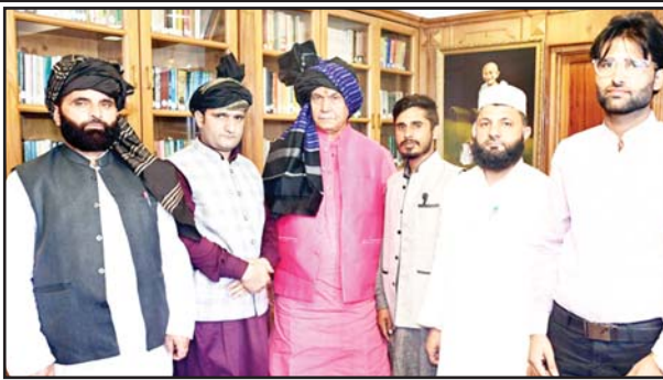
Lt Governor with a delegation of Bakerwal Community.

Dr Jitendra Singh informed that India has recently approved the National Quantum Mission (NQM) with an aim to seed, nurture and scale up scientific and industrial R&D and create a vibrant & innovative ecosystem