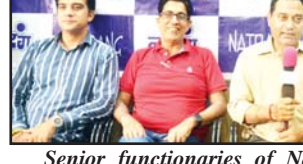
Senior functionaries of Natrang during a press conference at Jammu on Tuesday.

The workshop will have special focus on various ele-