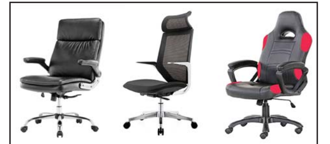
Saga Industries' joint chairs.