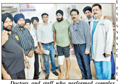
Doctors and staff who performed complex knee surgery at Govt Gandhi Nagar Hospital.