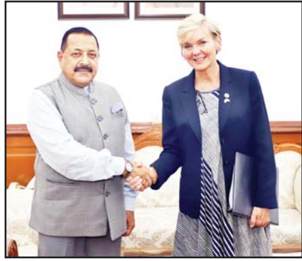
US Secretary, Department of Energy, Jennifer M. Granholm calling on Union Minister Dr Jitendra Singh at North Block, New Delhi on Tuesday.

Those who were present on this occasion includes Principal Secretary, Education; IT Consultant for UT; SIO, NIC besides other concerned officers of the Department.