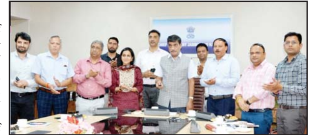
CS launching a competition on Tuesday.

Dr Mehta even advised the local NIC to generate reports highlighting the performance of different government depart-