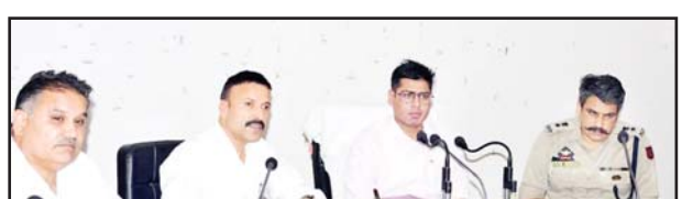
DDC Rajouri chairing a meeting on Tuesday.

Dr Jitendra Singh said, through this competitive grant program, the USISTEF selects and supports promising joint U.S.-India technology innovation and entrepreneurial initiatives that are commercially viable and socially relevant. He said, these joint initiatives can