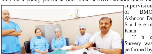
A doctor briefing media on a complex surgery performed at SDH Akhnoor.

JAMMU, July 19: A complex surgery was performed successfully on a young patient at Sub