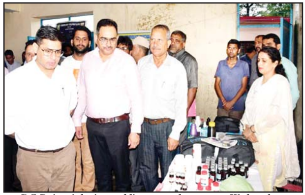
DC Rajouri during public outreach camp on Wednesday.

The Deputy Commissioner assured the public that all of their grievances have been documented and that all genuine concerns would be addressed in a phased