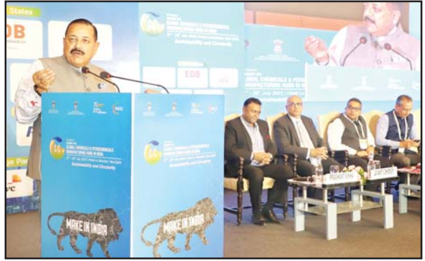
Union Minister Dr Jitendra Singh, as chief guest, addressing the "Global and Petrochemical Manufacturing Hubs" Summit-2023 at New Delhi on Friday.

Modi is himself always coming forward with new ideas and has a huge aptitude for innovation. "Prime Minister Modi's each Independence Day address is marked by Technology-driven, Skill-driven or Innovation-driven declarations. In 2014, Swachhata was the theme, it led to better healthcare and pulled out an esti-