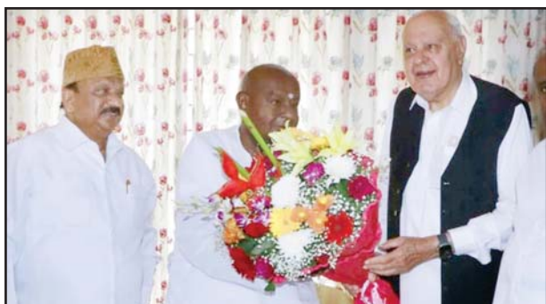
National Conference president Dr Farooq Abdullah meets former PM and JD(S) president HD Deve Gowda in Bengaluru, Karnataka on Wednesday.

Speaking to reporters after meeting former Prime Minister H D Deve Gowda at his residence, the leader said India's diversity should be protected.