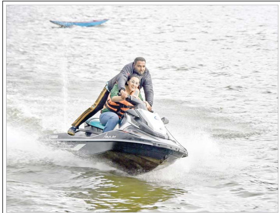
A tourist enjoying a motorboat ride on the waters of Dal lake in Srinagar.