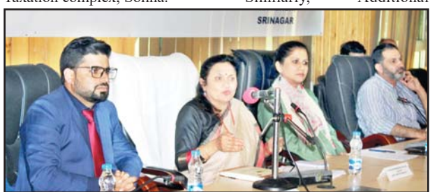
State Taxes Department officers during interactive session with Chartered Accountants.