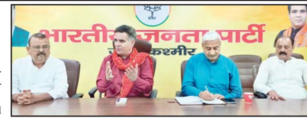
Senior BJP leaders in a meeting at Jammu on Wednesday.