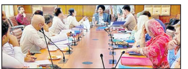
Commissioner Secretary I&C chairing a meeting.

division. The Secretary Level committee approved total 117 applications (90 applications of Jammu division and 27 of Kashmir) for registration under New Central Sector Scheme. The total finan-