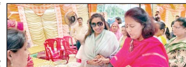
MD JKRLM and other dignitaries inaugurating 'Duggardhani'.

"The people of J&K are well convinced that it is the BJP and Narendra Modi Government that have been concerned for the peace, development and prosperity of J&K and there is no doubt that people will come to listen to the Union Home