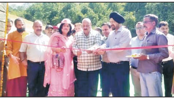
Commissioner Secretary inaugurating Public Park at Jhajjar Kotli on Wednesday.

The public park expanded over an area of 16 kanal has been developed by the depart-