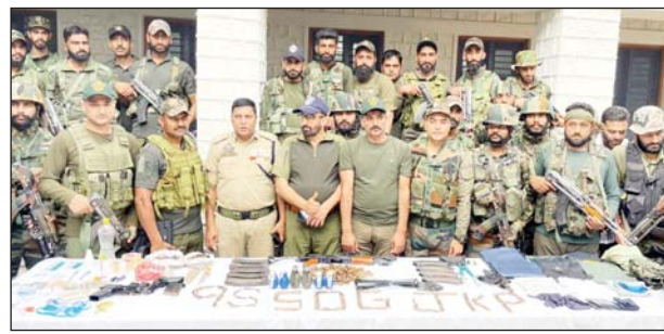
Arms and ammunition recovered by security forces in Poonch on Thursday.