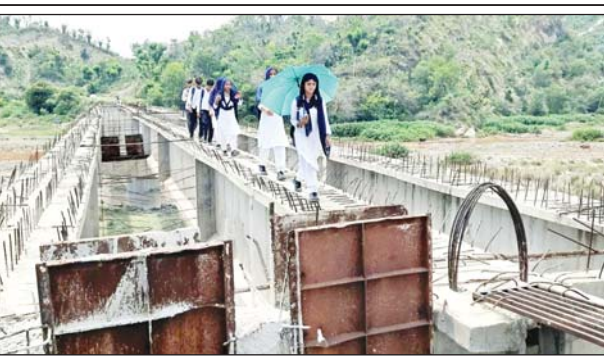
Students crossing over narrow beams of Ujh bridge near Jathana in Kathua.

Official sources told the Excelsior that this important bridge project worth Rs 45.54 crores was sanctioned by the Government during March 2015 under Central Roads Fund