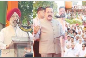
Union Ministers Hardeep Singh Puri and Dr Jitendra Singh addressing a mega public rally at Banotti, Kathua on Sunday.

KATHUA, June 18: While Union Minister of Housing and Urban Affairs and Oil & Natural Gas, Hardeep Singh Puri said that fast industrialisation has taken place in J&K