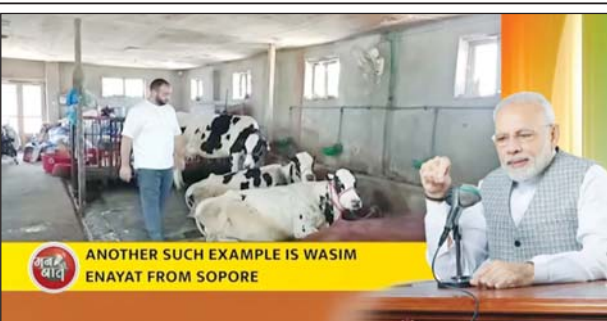
PM Narendra Modi during monthly Radio address 'Mann Ki Baat' referred to white revolution in Baramulla on Sunday.

"Nowadays, there has been a lot of discussion about Jammu and Kashmir in the country due to rising tourism and spectacular events of G20," the Prime Minister said referring to heavy tourist footfall in the Union Territory and successful conduct of Tourism Working Group