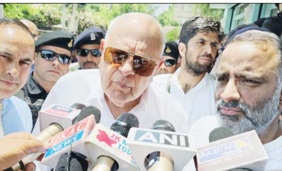
NC president Dr Farooq Abdullah speaking to reporters in Srinagar on Sunday.

by certain people should see how Muslims provide a helping hand to the Hindus here to perform the yatra comfortably." "Amarnath Yatra in Kashmir is an example of communal harmony, a lesson for those spreading hatred in the country," he added. Farooq said, it is good for the people of Kashmir that people