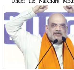
Union Home Minister Amit Shah today said Punjab's law and order is going from bad to worse but Chief Minister Bhagwant Mann has no time to spare for it and his only job seems to take the state aircraft for Arvind Kejriwal's nationwide tours.

mark the completion of nine years of the Narendra Modi Government. "Remember the time nine years ago, Congress party had indulged in Rs 12 lakh crore worth of scams...In these nine years, even our opponents cannot point a finger of corruption at Modi ji, who has run the Government in a transparent manner," Shah told the gathering.