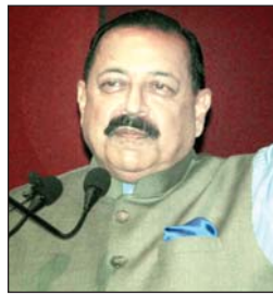
Giving full credit to the youth activists of Jammu who resisted all atrocities during the emergency Dr Jitendra Singh said they (Contd on page 4 Col 5)