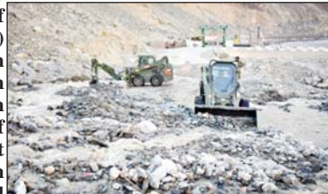
Men and machinery on job to repair badly damaged road near Turtuk. Another pic on page 4.

JAMMU, June 25: Troops averted major tragedy with timely rescue of locals and tourists trapped close to the Line of Control (LoC) with Pakistan in Turtuk area in the Union Territory of Ladakh late last evening when Glaciers and snow bodies melted due to rise in temperature leading to flash floods. Turtuk village on the LoC had shot into limelight following war between (Contd on page 4 Col 3)