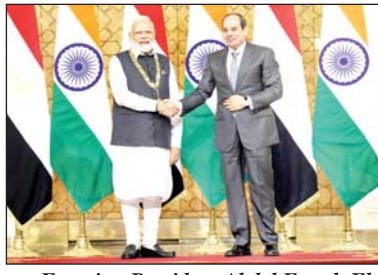
Egyptian President Abdel Fattah El-Sisi confers Prime Minister Narendra Modi with 'Order of the Nile' award - Egypt's highest state honour, during their meeting in Cairo, Egypt.

CAIRO, June 25: Prime Minister Narendra Modi was today conferred with the 'Order of the Nile', Egypt's highest honour, by President Abdel Fattah El-Sisi here. Instituted in 1915, the 'Order of the Nile' is conferred upon heads of states, crown princes, and vice presidents who offer Egypt or humanity invaluable services. This is the 13th highest state honour conferred upon Prime Minister Modi. "A mark of abiding friendship between India & Egypt! PM @narendramodi was conferred with the highest civilian honour of Egypt, Cairo," Ministry of External Affairs spokesperson Arindam Bagchi said in a tweet. The 'Order of the Nile' is a pure gold collar consisting of three-square gold units comprising Pharaonic symbols. The first unit resembles the idea of protecting the state against the evils, the second one resembles prosperity and happiness brought by the Nile and the (Contd on page 4 Col 3)