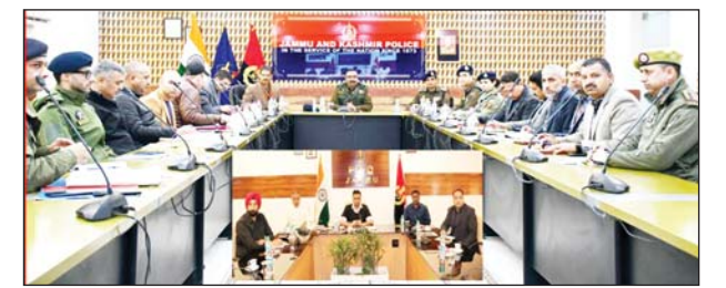
DGP chairing a meeting.