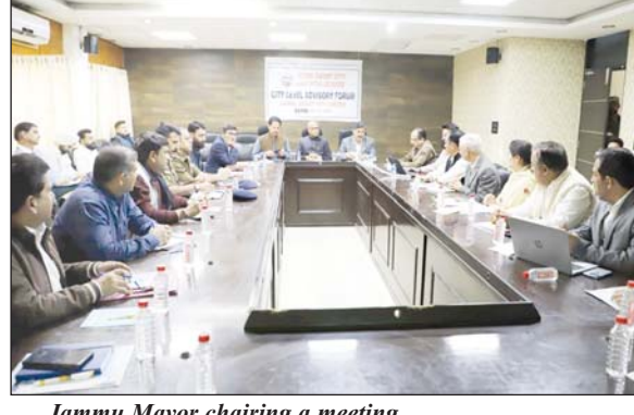
Jammu Mayor chairing a meeting.