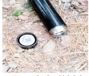
A water bottle which led to panic in Rajouri on Tuesday.

Excelsior Correspondent RAJOURI, Feb 28: A water bottle created panic in Panja Chowk area of this district in the morning. Suspecting it to be an Improvised Explosive Device (IED), police and CRPF personnel rushed to the spot and called the Bomb Disposal Squad. On detailed examination, the object turned out to be the water bottle left by some person.