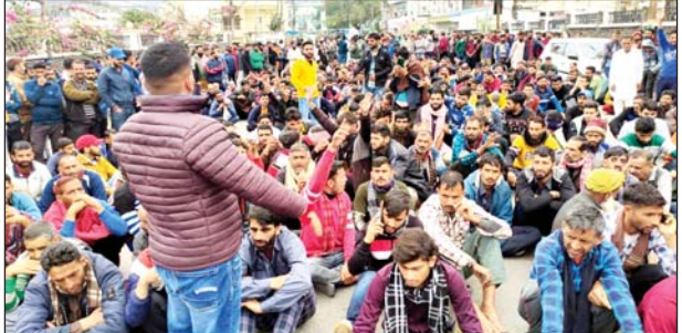
Locals staging protest dharna during Katra shutdown on Tuesday.

completed under 14th FC and 714 works completed under B2V3 program. It was further told that 84392 individual Household Toilets and 210 Community Sanitary Complexes have been constructed with an aim to create a neat and clean environment and to make the Halqa Panchayats open defecation free under Swachh Bharat Mission (Gramin). And, 183 villages have been declared open defecation free plus under SBM (G) Phase 2nd and rest of the villages are in the process of being declared as ODF Plus before March 2023. The meeting was further informed that 22 roads and 8 bridges have been completed under Languishing scheme while 112 vehicles have been distributed among the unemployed youth generating employment for 180 persons under Mumkin Scheme. Under Ayushman Bharat AB-PMJAY and AB-PMJAY-SEHAT schemes, 82.19% beneficiaries have been registered in the district.