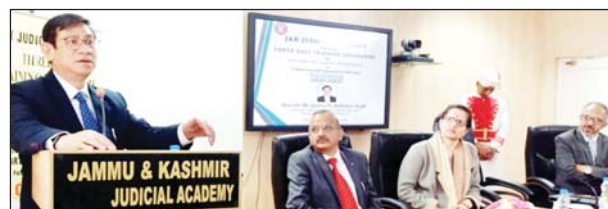
Chief Justice speaking during a training programme.

Delivering the inaugural address, Chief Justice stated that to achieve continuous improvement in any activity involving human effort and skill, giving training to those who are required to execute the activity plays an important role in achieving the goal. He said that the objective of training is to bring a systematic development of knowledge, skills and atti-