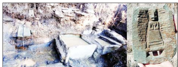
Stone sculptures discovered during digging in a Doda village.