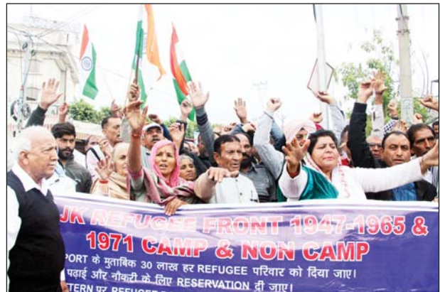
PoJK DPs staging protest demonstration near Hari Singh Park in Jammu on Tuesday.