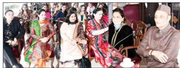
Senior Congress leader Dr Karan Singh speaking at a function in Jammu on Tuesday.

Replying to a question of taking back the regions of J&K occupied by Pakistan, he said that it was not easy as the same could not be materialized without a war which