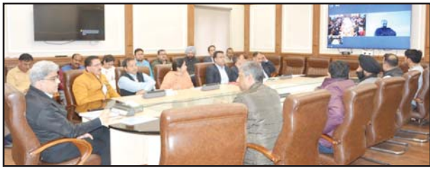
ACS APD chairing a meeting.