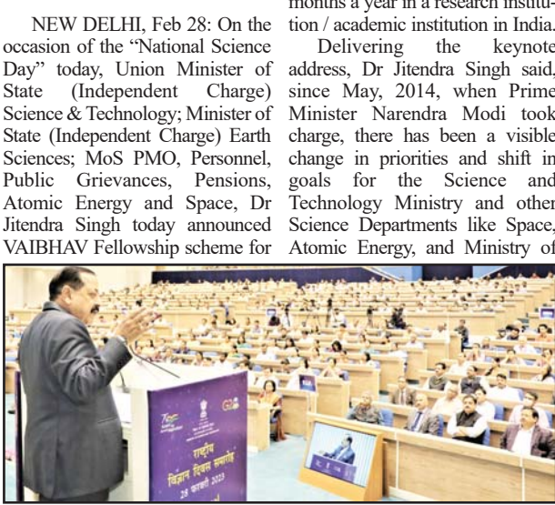
Union Minister Dr Jitendra Singh speaking, as chief guest, at the "National Science Day" programme at Vigyan Bhawan, New Delhi on Tuesday.

NEW DELHI, Feb 28: On the occasion of the "National Science Day" today, Union Minister of State (Independent Charge) Science & Technology; Minister of State (Independent Charge) Earth Sciences; MoS PMO, Personnel, Public Grievances, Pensions, Atomic Energy and Space, Dr Jitendra Singh today announced VAIBHAV Fellowship scheme for 1 month to a maximum of 2 months a year in a research institution / academic institution in India. Delivering the keynote address, Dr Jitendra Singh said, since May, 2014, when Prime Minister Narendra Modi took charge, there has been a visible change in priorities and shift in goals for the Science and Technology Ministry and other Science Departments like Space, Atomic Energy, and Ministry of