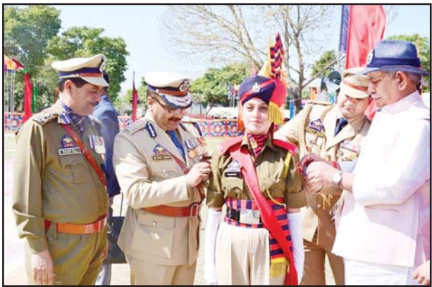
LG Manoj Sinha felicitates a new recruit at PTS Kathua on Friday.

pening in Jammu and Kashmir. militancy is completely finished in Jammu and Kashmir. Asserting that India has become third largest economy in the world, Sinha said the