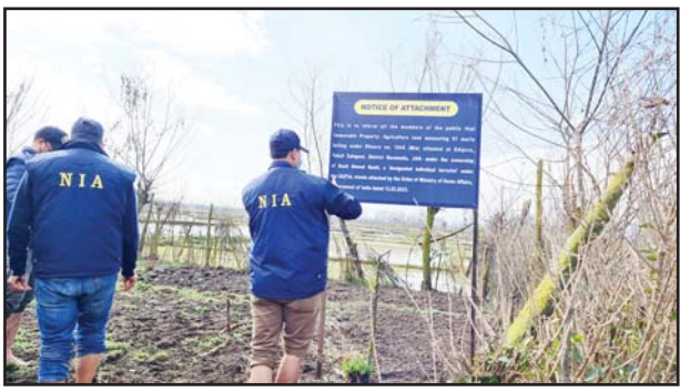
NIA team attaching the property of HM militant in Baramulla.