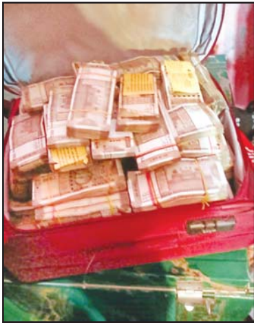
Cash recovered by police in Poonch.