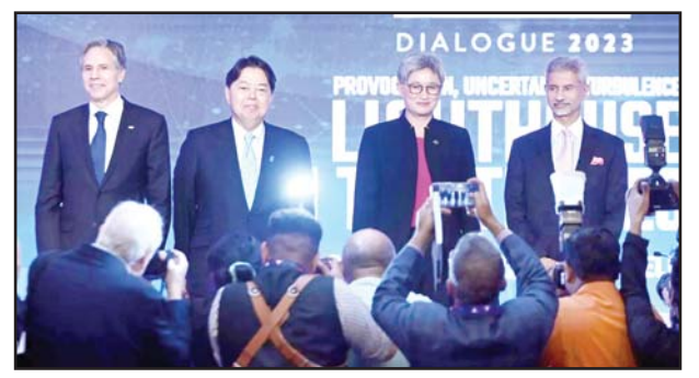
US Secretary of State Antony Blinken, Japanese Foreign Minister Yoshimasa Hayashi, Australian Foreign Minister Penny Wong and Indian Foreign Minister Subrahmanyan Jaishankar attend a Quad Ministers' panel at the Taj Palace Hotel in New Delhi on Friday.

They also reaffirmed the grouping's commitment for a free and open Indo-Pacific and said it strongly supports the rule of law, sovereignty, territorial